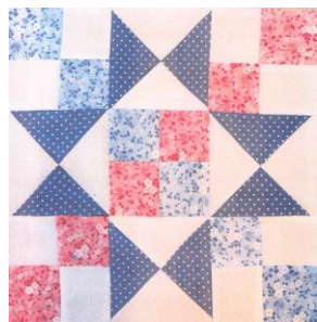
Chained Star Block