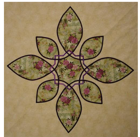
Cheryl's Crystal block with an Asian focus fabric. Her bias fabrics were a dark purple and a purple batik.

Reminder to all members: "All thing Paper Piecing" – Please bring your quilts, quilt tops, and quilt blocks made using paper piecing techniques to share as part of the March Program.