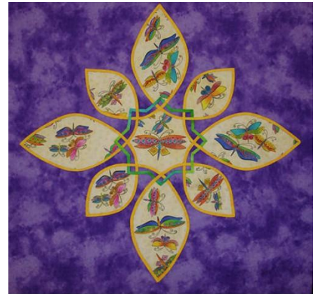
Nancy's Crystal block, made with a dragonfly focus fabric. Her bias fabrics were a solid yellow and a green/blue hand dye.

The Class is only $55 and the pattern you can download pdf at https://scarlettrose.com/epatterns.html You will also need a bias tape maker. (More information to come). Check out our program webpage for latest updates: https://www.llqq.org/meetings-programs--workshops.html