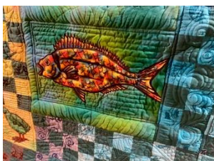
2027 Opportunity Quilt