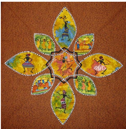
Marilyn's Crystal block, made with African theme fabrics. Her bias fabrics were a zebra stripe print and a solid black.